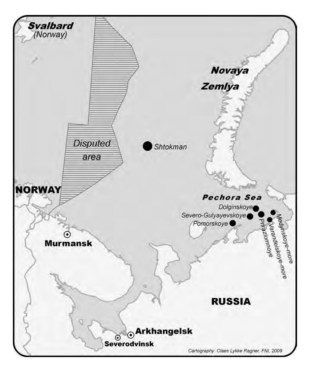
Figure 2: Russian oil and gas fields in the Barents and Pechora Seas.

A coincidence of time and geography is at play. Norwegian petroleum interests are moving northwards from the North Sea into the Barents Sea, while the Russian petroleum industry is moving from on-shore to off-shore developments in the Arctic. Shtokman is what brings the two together for the moment. Shared energy interests may over time draw Norwegian industry further to the east into the Kara Sea and the development of the Timan Pechora basin. Norway and Russia are not competitors in terms of pipelines or markets and in this respect